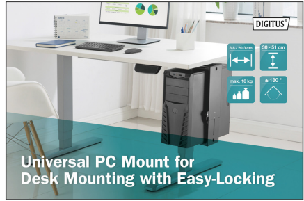
Universal PC Mount for Desk Mounting with Easy-Locking