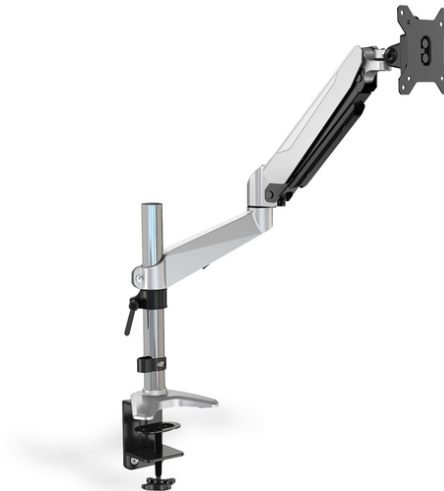
Table mount for LCD/LED monitor up to 69cm (27") fully flexible gas spring mount,max load 8kg

Attach a monitor between 15" - 32" to your desk easily with the desktop monitor bracket and a clamp fixture. Easily set up the monitors according to your needs and swivel, tilt or turn them, for example, when it comes to portrait-format monitors. The integrated pneumatic spring makes it easy to set your monitor to the right height. Do something good for yourself and your health by adjusting your monitor to the optimal position for your body and seat. Additionally, the monitor cables can be neatly stowed in the cable routings provided.