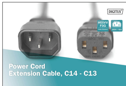
Power Cord Extension Cable, C14 - C13