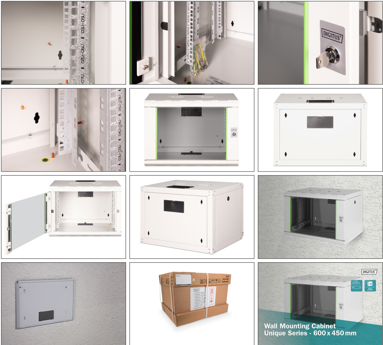
Wall Mounting Cabinet Unique Series - 600 x 450 mm