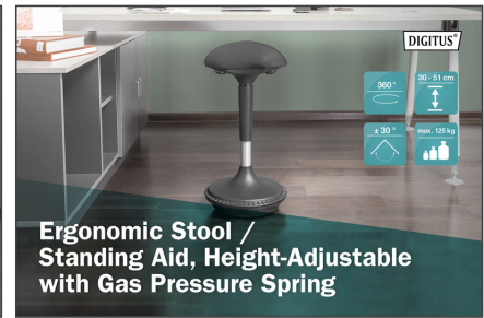
Ergonomic Stool / Standing Aid, Height-Adjustable with Gas Pressure Spring