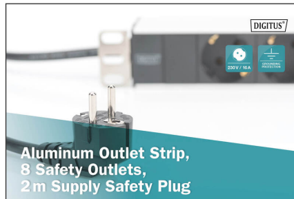
Aluminum Outlet Strip, 8 Safety Outlets, 2m Supply Safety Plug