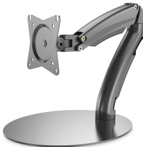
Table stand for LCD/LED monitor up to 27" flexible gas spring mount, max 6,5kg, VESA 100x100

Suporte de monitor universal para montagem de monitores LED e LCD de todas as marcas, até o tamanho de 69 cm (27"). Graças ao braço com mola de pressão a gás pode fixar o seu monitor à altura que desejar. Tenha apenas atenção à dimensão VESA, bem como ao peso do seu monitor, de modo a escolher um suporte adequado.