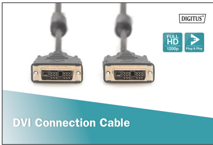
DVI Connection Cable