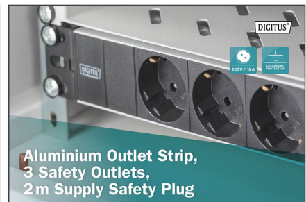
Aluminium Outlet Strip, 3 Safety Outlets, 2m Supply Safety Plug